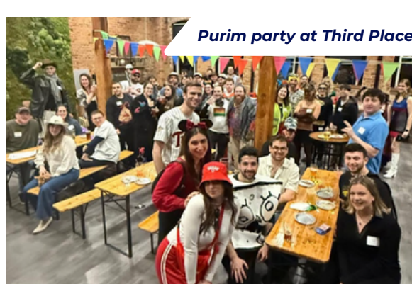
Purim party at Third Place