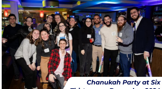
Chanukah Party at Six Thirteen on December 2024

The annual Chanukah celebration drew over 110 young professionals from across Fairfield County, establishing us as the premier destination for young Jewish adults in the region. The Fire Station Menorah Lighting demonstrated positive community presence. The intergenerational programs at Brighton Gardens showed them the mitzvah of honoring elders.