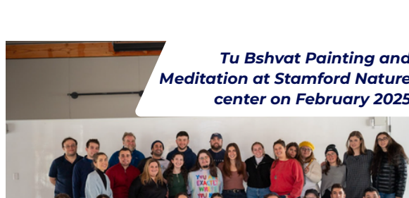
Tu Bshvat Painting and Meditation at Stamford Nature center on February 2025

on March 9th filled the room with laughter and Jewish pride, showing your children how to celebrate their heritage with confidence and humor. The Purim festivities were extraordinary: March 13th brought a packed house at Third Place Brewery with costumes, dancing, drinks, and vibrant Purim spirit, followed by a community-wide Purim celebration and festive meal on March 14th that maintained Jewish authenticity while engaging with the broader world.