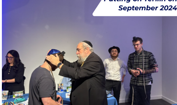
Putting on Tefilin on September 2024

High Holiday services at a prestigious waterfront location provided inspiration and meaningful community connection. The Breakfast with Friends made breaking the fast feel like a celebration. The Shofar on the boardwalk taught them to be proud ambassadors of Jewish tradition, while Sukkot programming showed them how to bring Jewish joy into every aspect of life through innovative Sukkah Mobile .