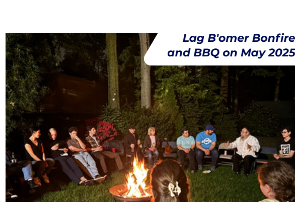
Lag B'Omer Bonfire and BBQ on May 2025