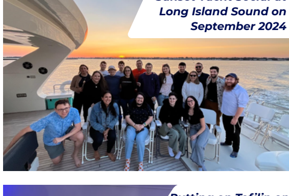
Sunset Yacht Social at Long Island Sound on September 2024

The SUNSET YACHT RIDES and END-OF-YEAR BBQ showed the participants that Jewish community can be meaningful, joyful, and celebratory.